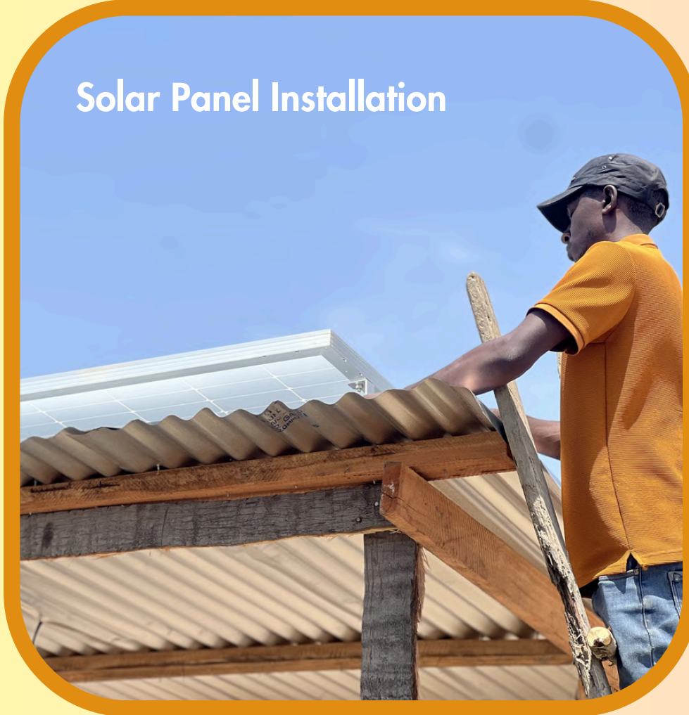
Solar Panel Installation

Building on this progress, RIWE_AFRICA is exploring ways to help agropastoralists adopt small-scale irrigation systems, expanding water use beyond livestock to support food crop production and improve nutrition outcomes.