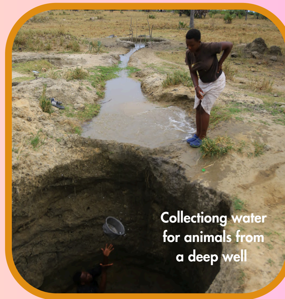
Collecting water for animals from a deep well

My hope is that more communities can receive this kind of support so that other children, like me, can stay in school and have a better future.