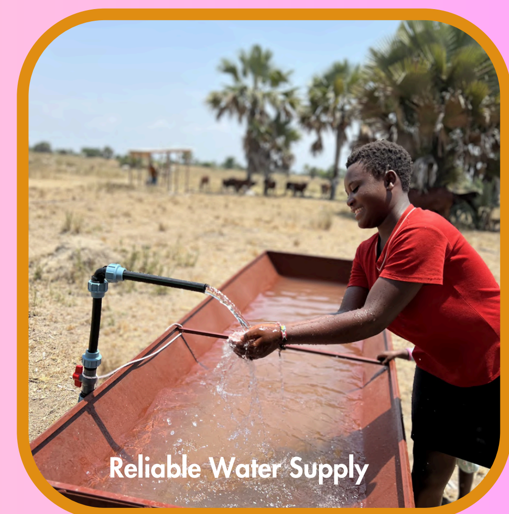
Reliable Water Supply