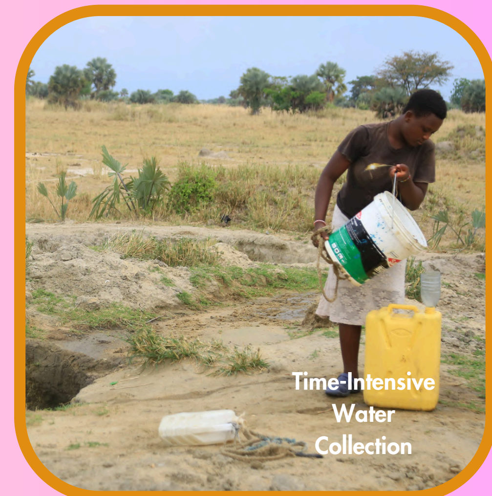
Time-Intensive Water Collection