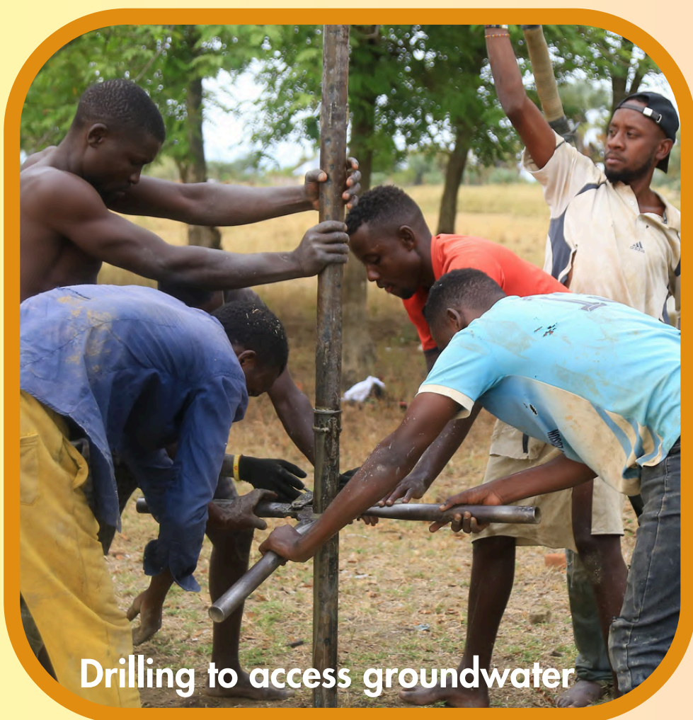
Drilling to access groundwater