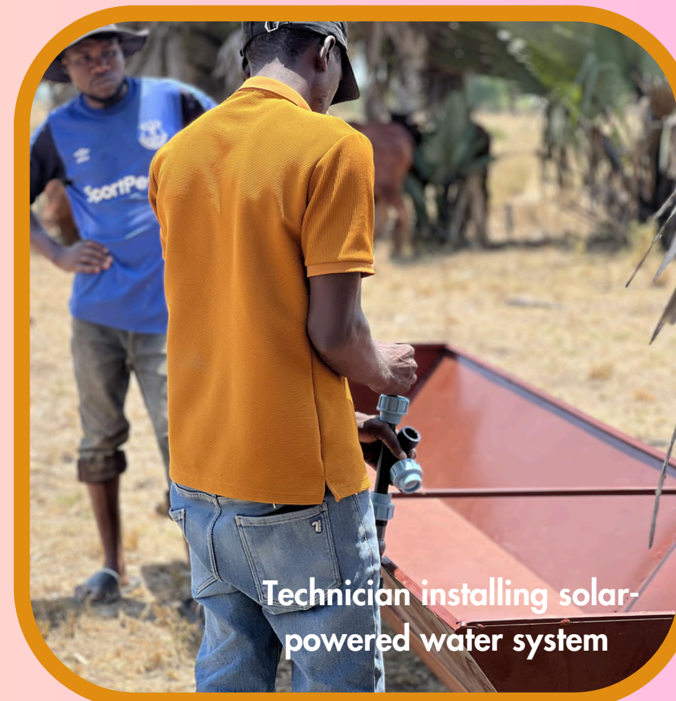
Technician installing solar-powered water system