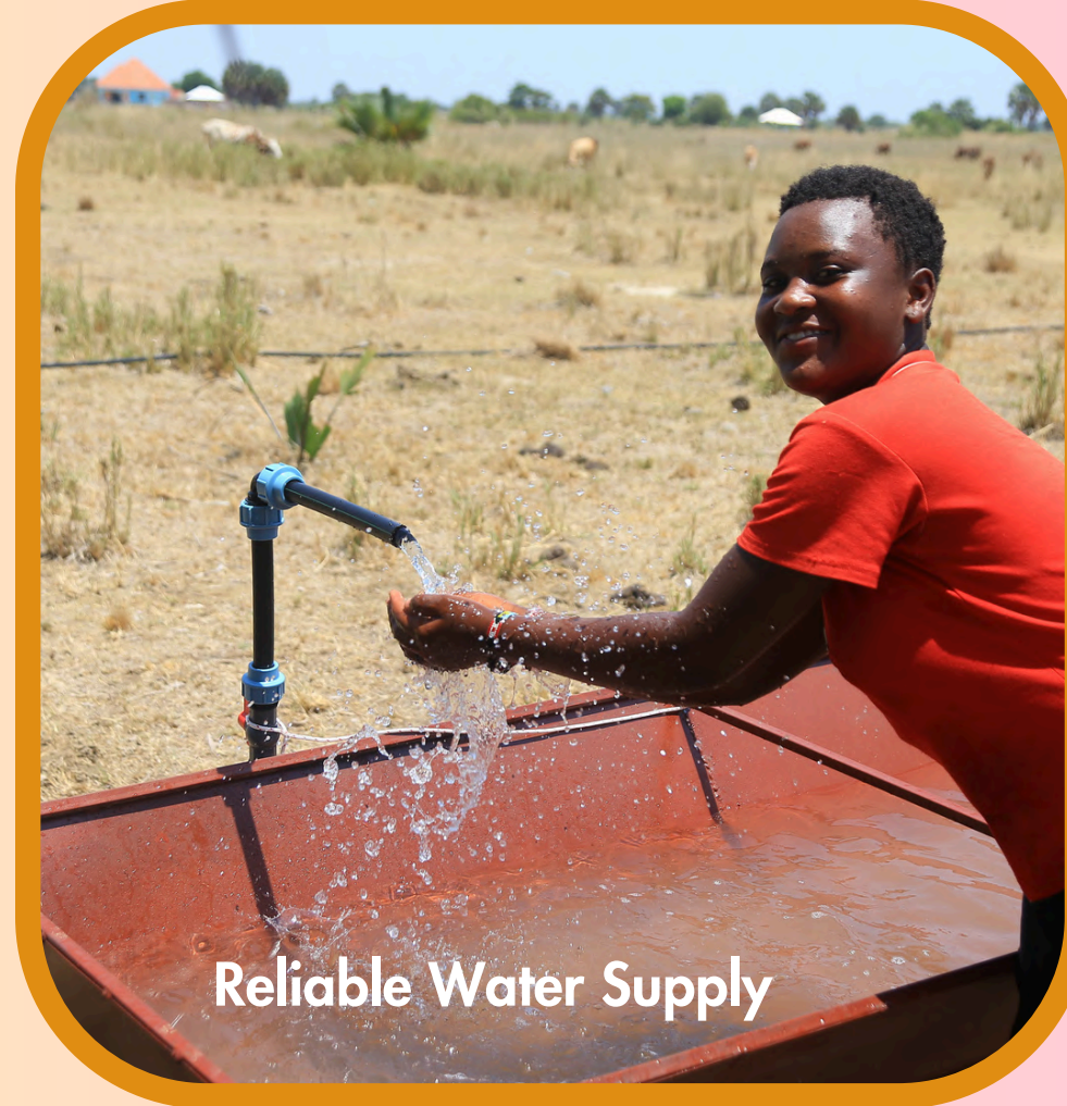
Reliable Water Supply